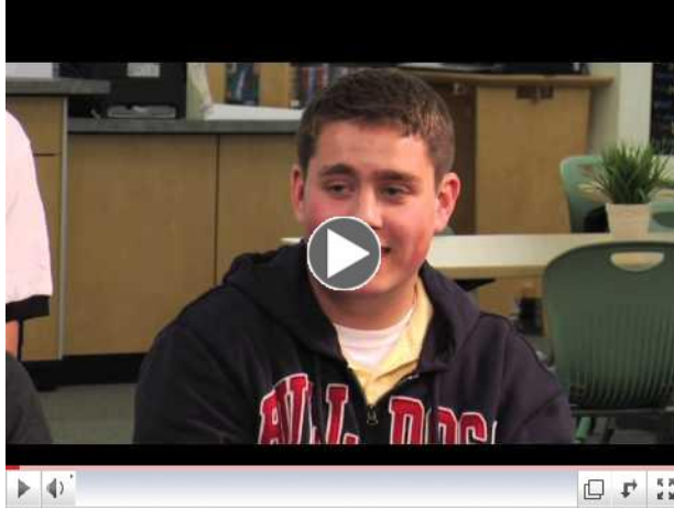
Teens Share Why Parents are Key to Buckling Up